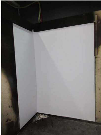
Before Test (EN 13823)

Area Density of the test specimen: 259 g/m 2