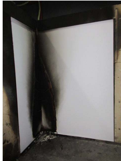
After Test (EN 13823)